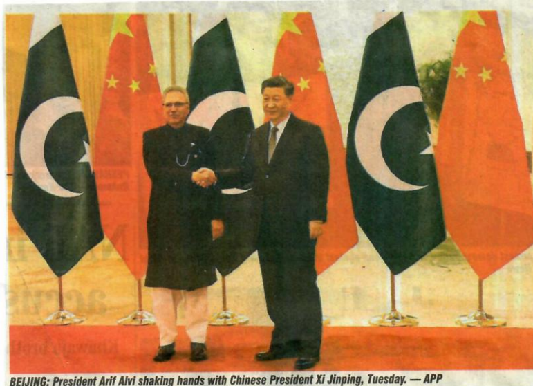
BEIJING: President Arif Alvi shaking hands with Chinese President Xi Jinping, Tuesday.