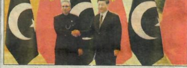
چیننگ: صدر مملکت ڈاکٹر عارف ملوی چینی وزیر زراعت سے معاہدہ کر رہے ہیں

صدر ملوی کا چینی رہنما سے ہاتھ ملاکر اظہارِ رنجش پاکستانی طلباء، تھائی 'کامیاب ہوئے' اسلام آباد چیننگ (خصوصی نیوز پر درود قائل) چینانومی، زراعت اور کورونا وائرس کے خلاف ٹکار (کینیڈا) پاکستان اور چین نے سائنس و چینک میں دوطرفہ تعاون (پاکستان 5 مئی 2021)