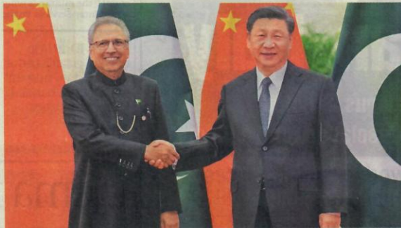
GREAT HALL MEET: President Dr Arif Alvi shakes hands with his Chinese counterpart Xi Jinping in Beijing.

According to a joint statement issued at the conclusion of the visit of President Arif Alvi to Beijing, China recognised measures taken by Pakistan to combat terrorism financing and appreciated the resolve with which Pakistan implemented the action plan of the Financial Action Task Force (FATF). The statement said that