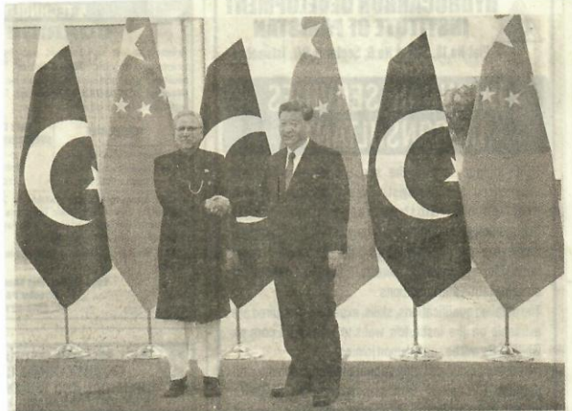
BEIJING: President Dr Arif Alvi shakes hands with Chinese President Xi Jinping prior to a meeting on Tuesday.