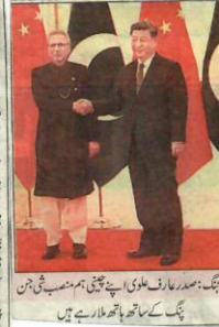
پنگ: صدر عارف علوی اپنے چینی ہم منصب شی جن پنگ کے ساتھ ہاتھ ملارہے ہیں