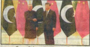
چیک (فدائیکسپا) صدر ملکی (بائیں) اور پاکستانی صدر عارف ملکی (دائیں) کے ساتھ مل کر ایک تقریب میں۔

صدر عارف ملکی کی طبیعت میں کمی کی وجہ سے پاکستانیوں کے جانے کا عزم