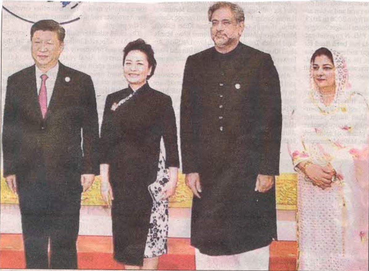
BOAO: Prime Minister Shahid Khaqan Abbasi and President Xi Jinping with their spouses at Boao Forum for Asia.