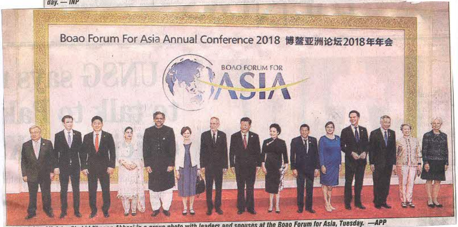
BOAO: Prime Minister Shahid Khaqan Abbasi in a group photo with leaders and spouses at the Boao Forum for Asia, Tuesday.