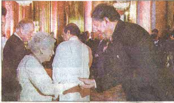
لندن، وزیراعظم شاہد خاقان عباسی ملکہ ایلیزابتھ سے سربراہان مملکت کے اعزاز میں عشائیہ پر ہاتھ ملاتے ہیں