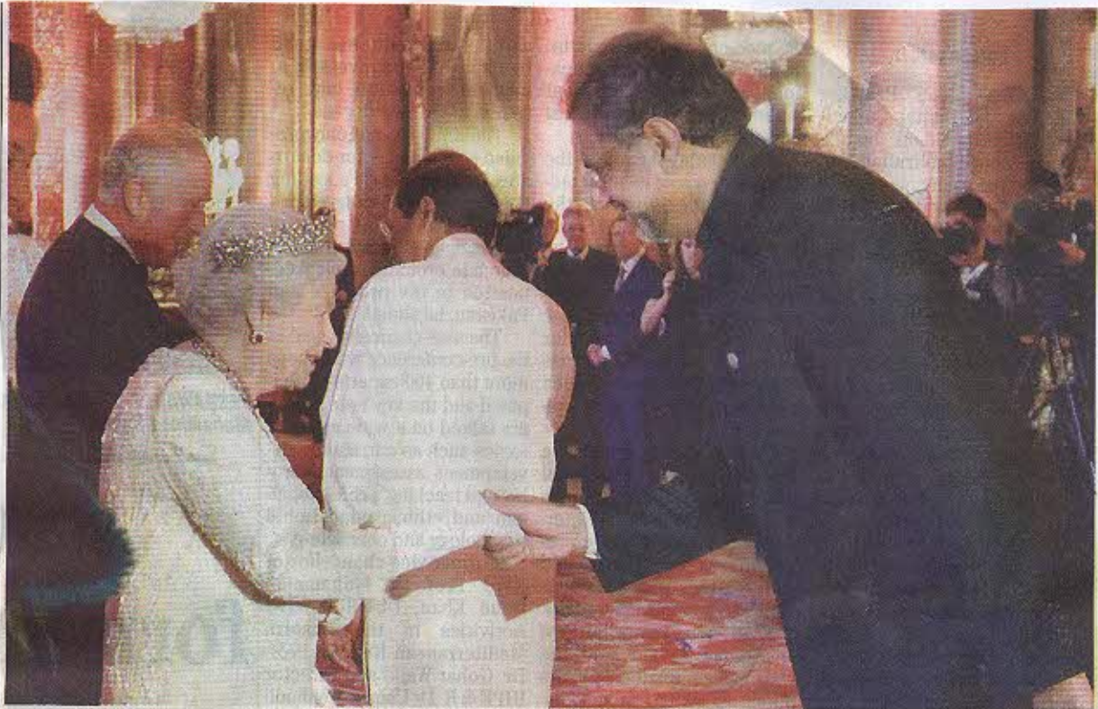
LONDON: Prime Minister Shahid Khaqan Abbasi being received by Queen Elizabeth II at the dinner reception hosted by her for Commonwealth heads of government and spouses in Buckingham Palace, Friday.